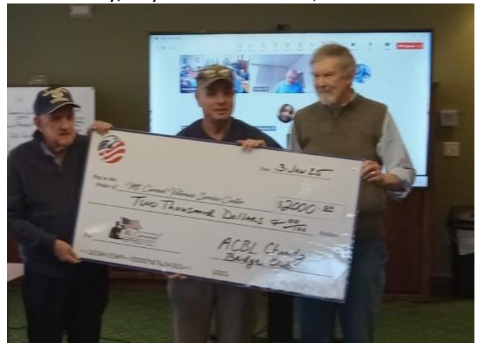
ACBL donates $2K to Mt Carmel Veteran's Org.